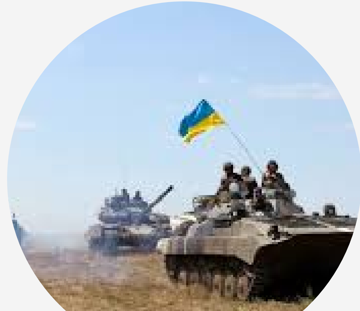
WAR IN UKRAINE